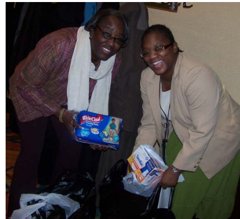
Donations for St. Ann's Infant & Maternity Home